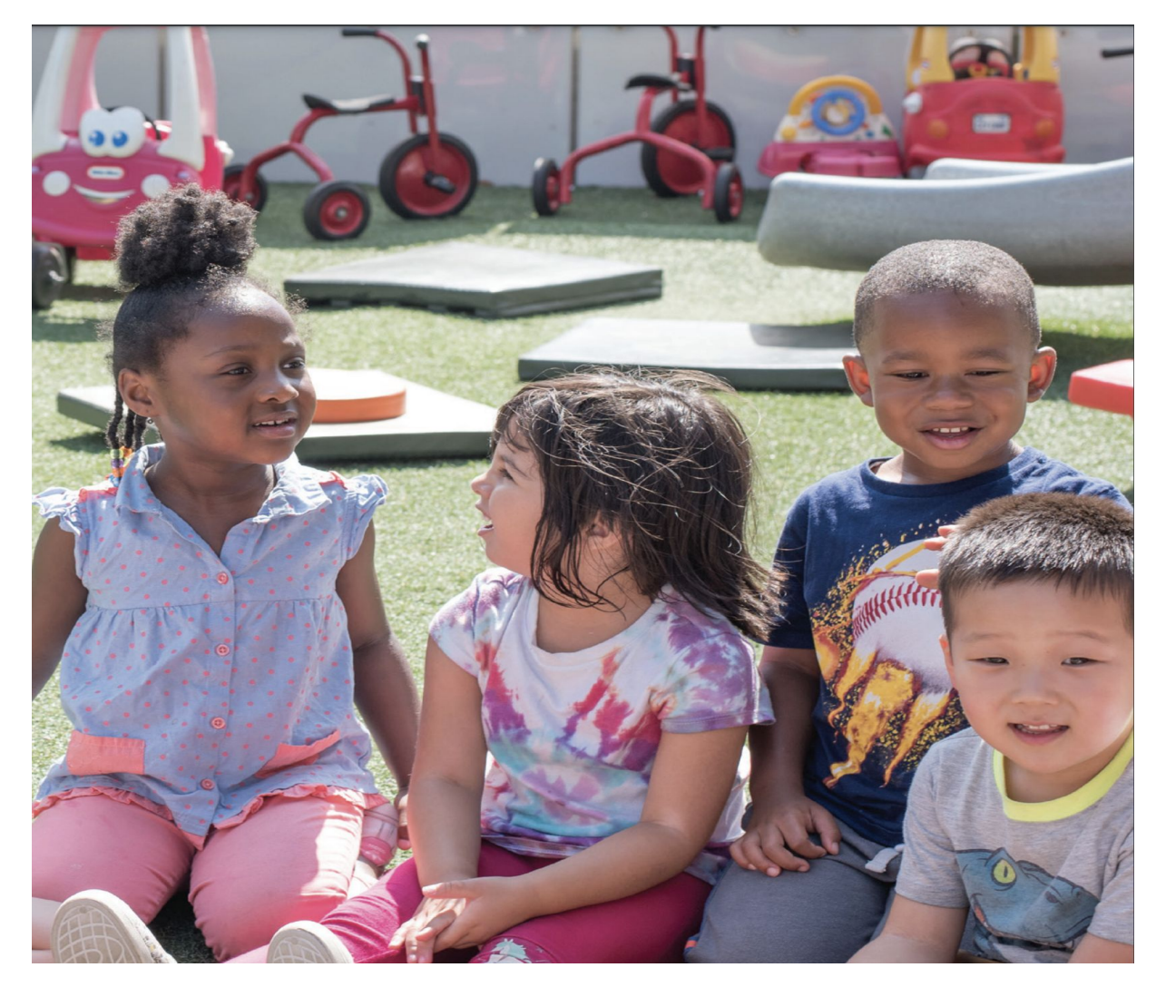
Source:2019 Best Starts for Kids Annual Report

In Burien, current child-care benefits are limited and restrictive (e.g., financially, geographically, etc.). The people who most need the benefit are not able to access because of systemic barriers. The issue is about providing affordable, high-quality childcare to individual families and addressing the broader social and economic impacts (reduced labor force participation and productivity, limitations to better job opportunities, unequal access to services) to the community, as a result of the lack of accessible, affordable, high-quality childcare.